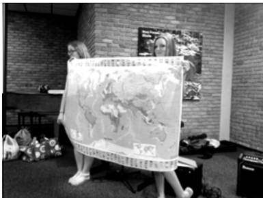
Props used during opening worship to illustrate days of creation

district would answer that very question as we journeyed throughout the weekend.