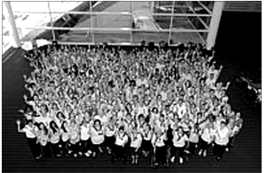
The workers in the 2013 Coalition of 6 Host Districts, including the SELC District - in their work uniforms-teal and maroon scarves with yellow shirts and black pants or skirts

Service. He spoke poignantly about how the deaths of his parents had affected him, and concluded from his personal struggles that he would bless the Lord at all times, and continually praise God. He ended by singing, "I've Got a River of Life Springing Up in Me."