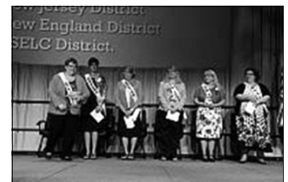
The Six Host District Presidents