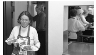
Here comes the food ...