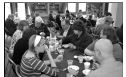
... to the hungry crowd!