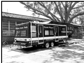
Grain Train still a presence in Biloxi

A Lutheran organization that is serving the poor among us today is Orphan Grain Train. They sponsor orphanages in countries such as Estonia, Kyrgyzstan, Latvia, Lithuania, and Russia. They