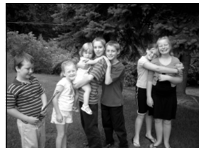
He has welcomed us into His